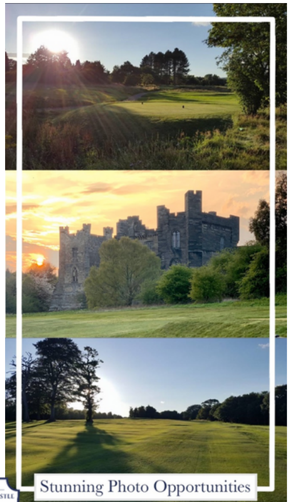
Stunning Photo Opportunities